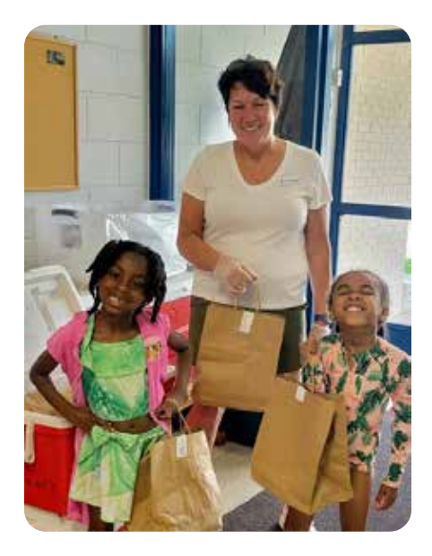
Children receiving a weekend food "backpack"

"The CACFP food program has been an absolute blessing to our family. Recent changes to the SNAP and Medicaid programs have meant that we no longer qualify for food assistance or medical assistance. The unexpected expense of acquiring new health insurance and no longer receiving SNAP benefits has been difficult for our family. Knowing that my son will receive both breakfast and lunch each day he is in care has been a huge relief for us. We are so grateful for all the help we have received from the YMCA and the CACFP program. From our entire family, Thank you to the donors who make these programs possible."