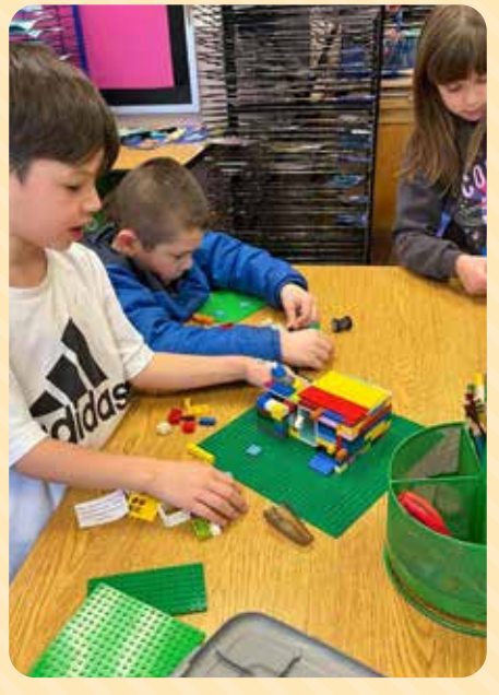
ABOVE: Students at Three Bridges School working on their 'Island Shelter' in our STEAM Survivor Club