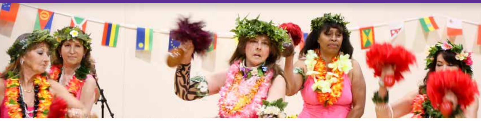
The Tehani Dance Troupe performs Polynesian dances at the Welcoming Week International Potluck.